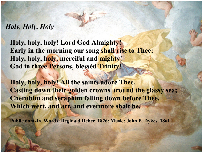
Holy Trinity, fresco by Luca Rossetti da Orta, 1738-9

Public domain. Words: Reginald Heber, 1826; Music: John B. Dykes, 1861