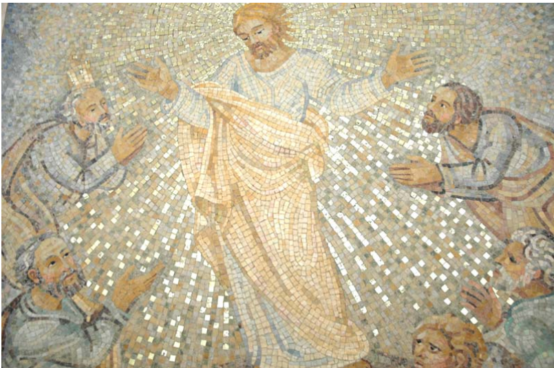
Transfiguration , Mosaic, Vatican, 20 th Century