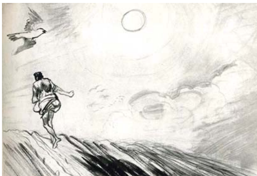
The Sower , Edouard Leon Louis Edy-Legrand, 1950