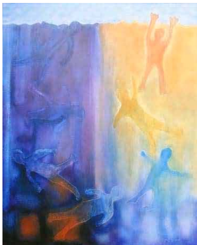
Baptism, Cornelis Monsma, 2005