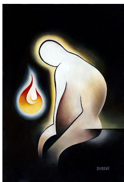
Contemplation, Chris Shreve, contemp