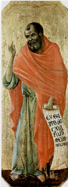
Prophet Hosea , Duccio di Buoninsegna, 1308