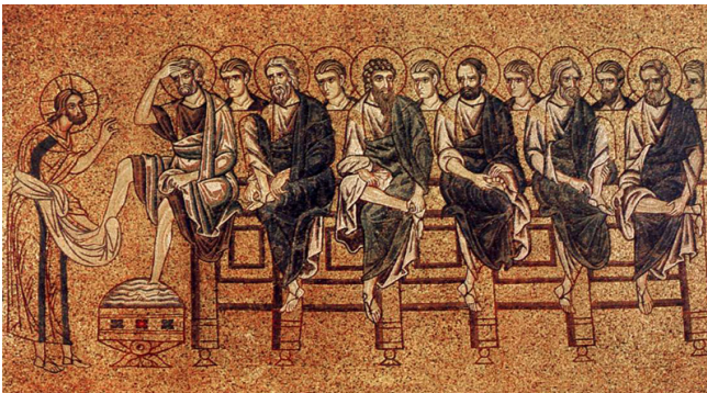
Christ Washing the Disciples Feet , mosaic, ca 1210