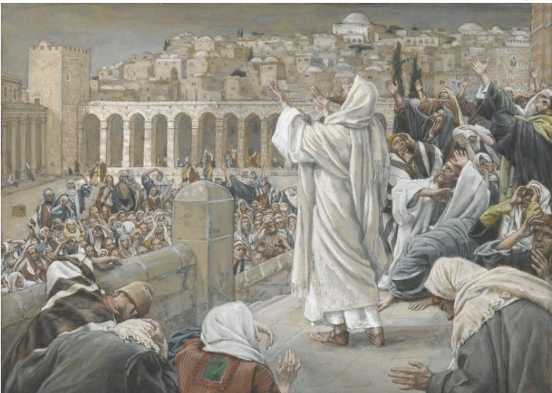
The Voice from On High , James Tissot, c. 1875