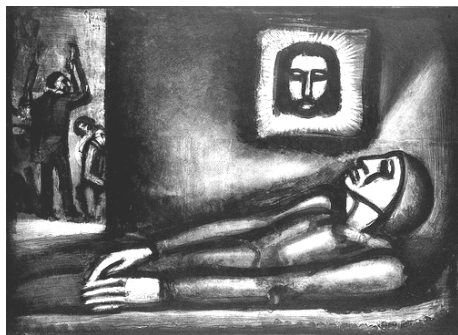
De Profundis [Out of the Depths] , Georges Rouault, 1928