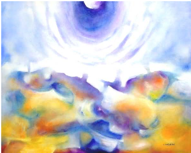
Resurrection Valley , Cornelis Monsma, Contemporary