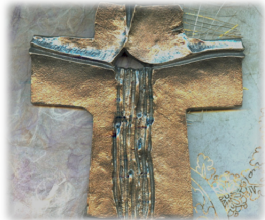
Living Waters Cross , Maria Laach, Contemp.