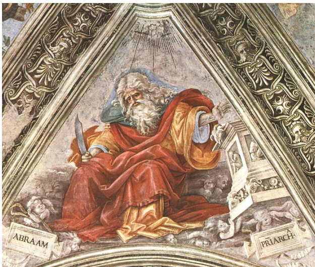
Abraham , Filippino Lippi, 1502