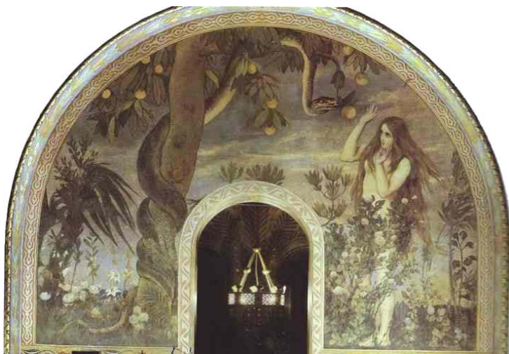
The Temptation , Viktor Mikhailovich Vasnetsov, fresco, 1896