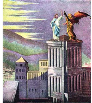
His Temptation , 1909

Our Father, Who art in heaven, Hallowed be Thy name. Thy kingdom come, Thy will be done, On earth as it is in heaven. Give us this day our daily bread, And forgive our debts as we forgive our debtors. And lead us not into temptation, but deliver us from evil. For Thine is the kingdom, and the power, and the glory, Forever. Amen