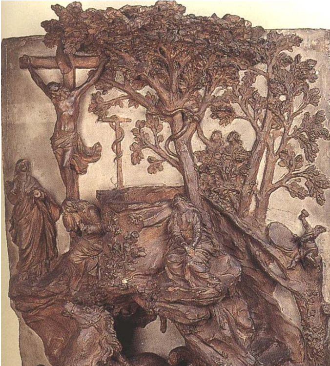
Crucifixion , Michiel Vervoort the Elder, wood pulpith, 1723

— based on John 4:24; 2 Corinthians 5:17-21