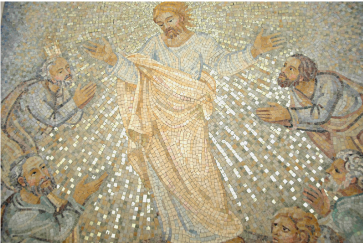
Transfiguration , Mosaic, 20 th Century Basilica of St. Peter