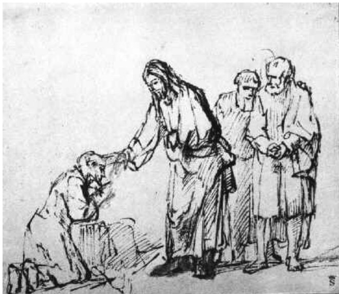
Christ Healing a Leper , Rembrandt, c. 1657