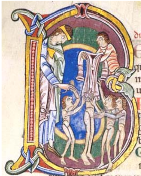
He Has Distributed, He Has Given to the Poor , St. Albans Psalter, 12 th Century