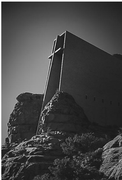
Chapel of the Holy Cross - Sedona, Doug Asche, 2007