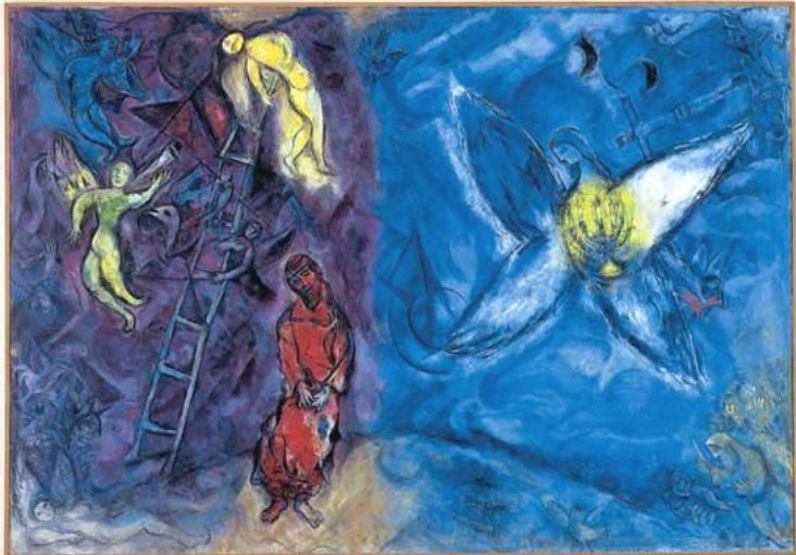
Le Songe de Jacob , Marc Chagall, 2002