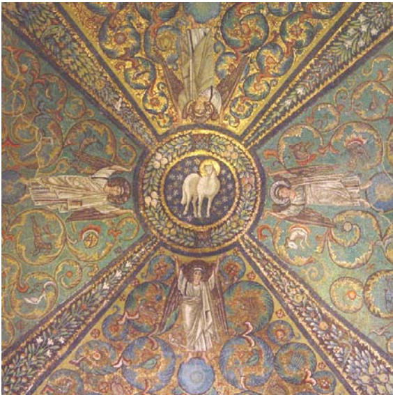
Agnus Dei , Basilica St. Vitale, AD 521-547

Epiclesis: An Ancient-Future Faith Community Sunday mornings at The Carmichael Chapel, 4600 Winding Way (Corner of Winding Way and Pasadena), Sacramento, CA 95841. Informal gathering: 10:00 AM; Worship at 10:30 AM.