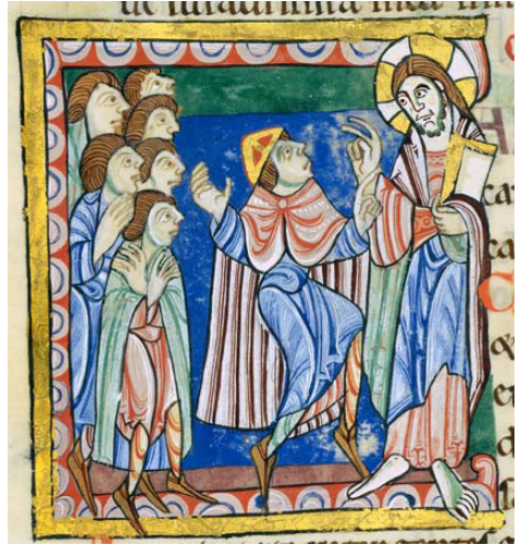
Sing to the Lord a New Song , St. Albans Psalter, early 12 th century

He pulled me out of my despair, And showed me where to walk. From fear into security, From quicksand to the Rock.