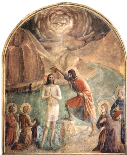
Baptism of Christ , Fra Angelico, ca. 1400 - 1455