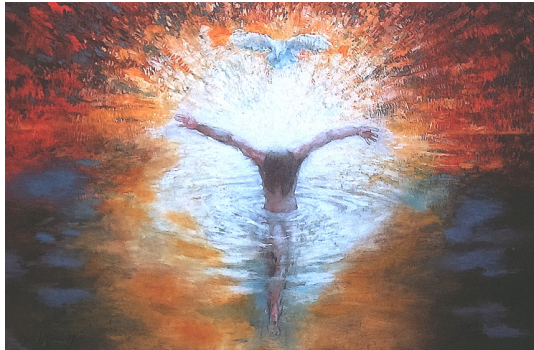
Baptism of Christ 2 , Daniel Bonnell, Contemporary