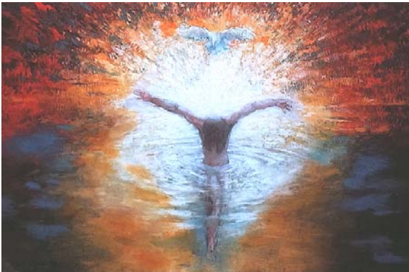
Baptism of Christ 2 , Daniel Bonnell, Contemporary