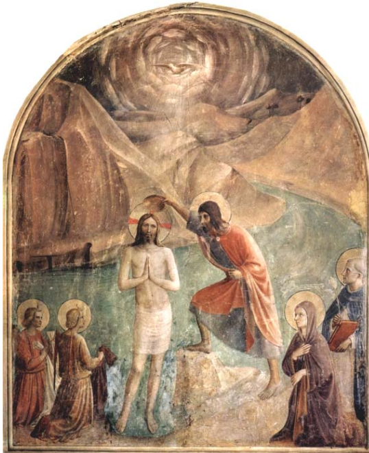
Baptism of Christ , Fra Angelico, ca. 1400 - 1455