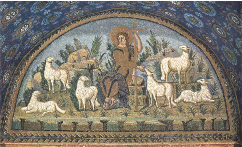
The Good Shepherd , Mausoleum of Galla Placidia, 5 th Century