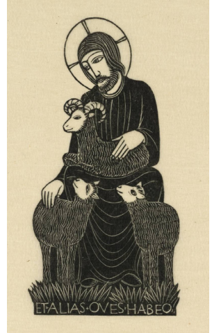
The Good Shepherd , Eric Gill, 1926

I call You Shepherd; Lord, You're my Shepherd; You're the Good Shepherd to me.