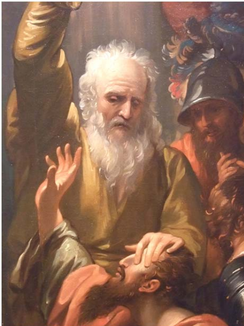
Conversion of St. Paul, Benjamin West, c.1786