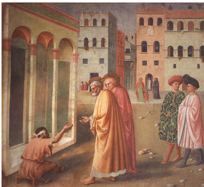
Healing of the Cripple , Masolino da Panicale, 1426-1427

— from Acts 3:13-15, Psalm 52:9, 71:14-16