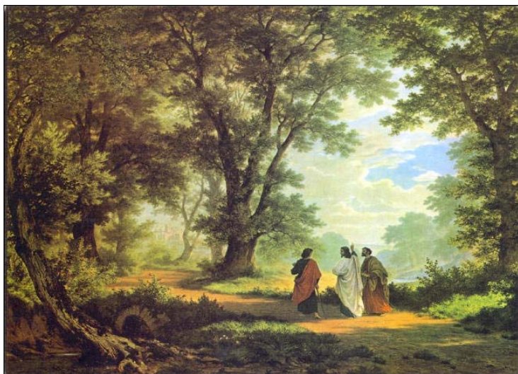
The Way to Emmaus , Zund, 1877