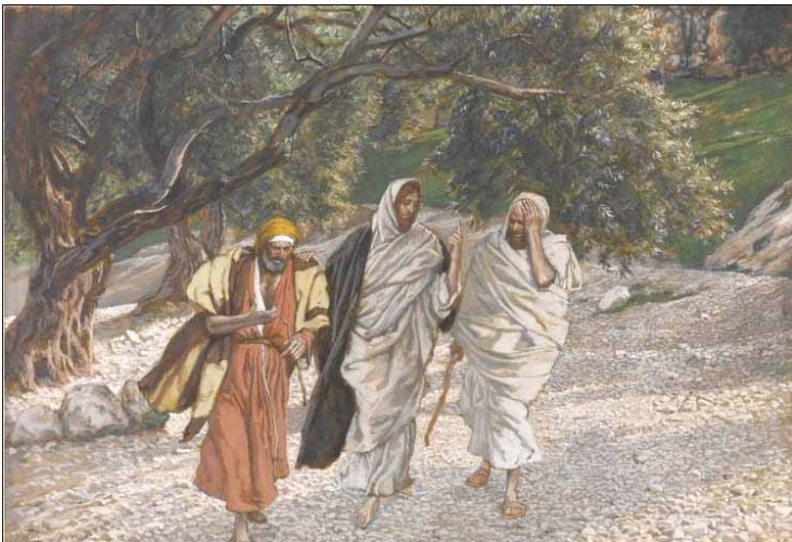
The Pilgrims of Emmaus , Tissot, (1886-94)