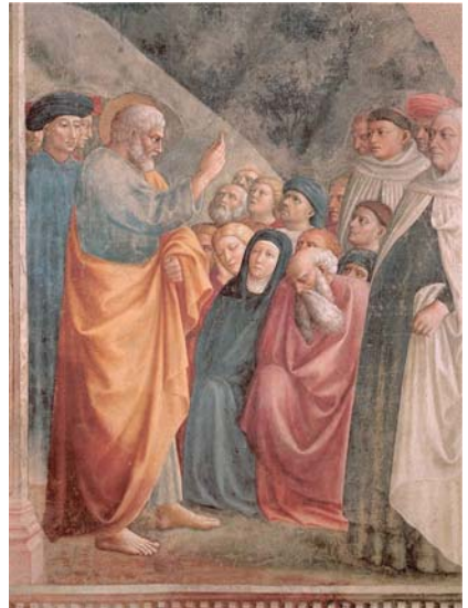
St Peter Preaching , Masolino da Panicale, 1427