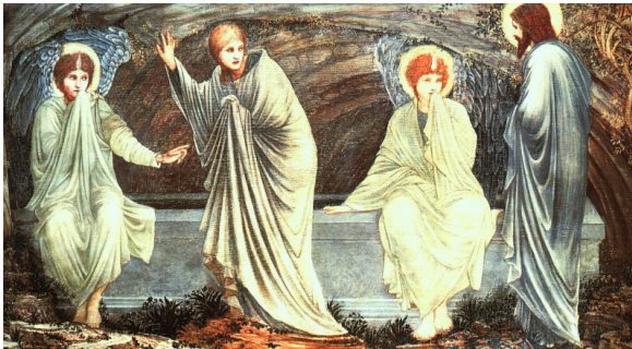
The Morning of the Resurrection, Sir Edward Coley Burne-Jones, 1882