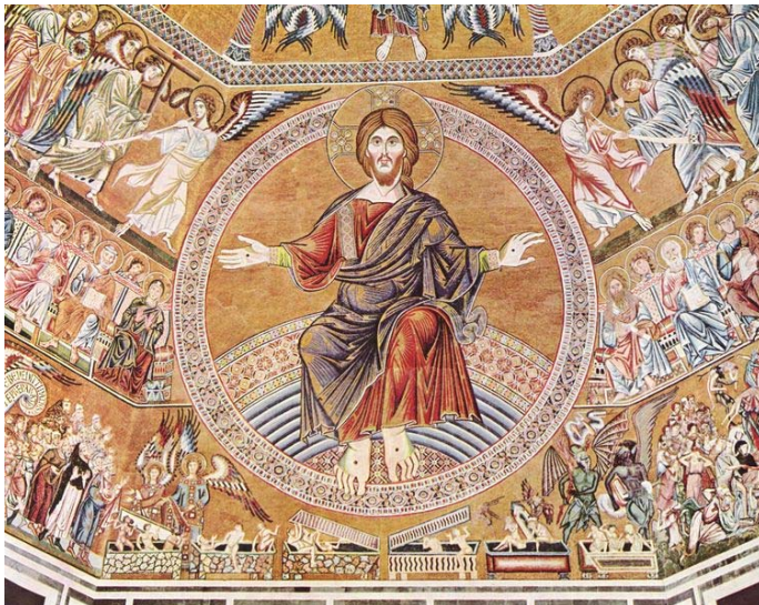
Christus Pantokrator und das Jungste Gericht, Florentinischer Meister, 1300

– Psalm 97:1-2, 12; Rev. 11:17, 12:10, 15:3-4