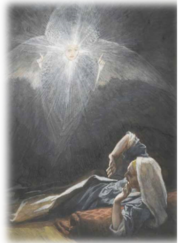
The Vision of St. Joseph James Tissot, c. 1880

It is right to give Him thanks and praise.