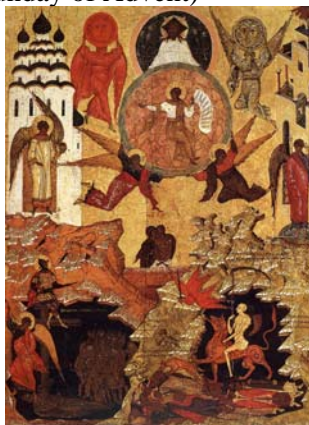
The only Begotten of the Father and the word of God, 1540-1550, Cathedral of the Sleeper, Kremlin, Moscow