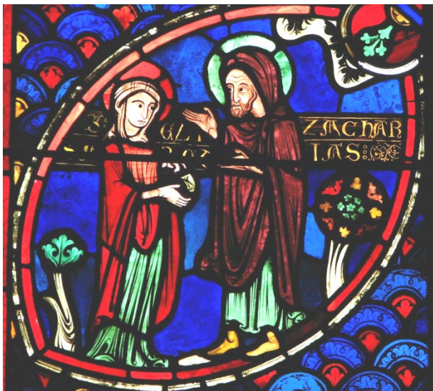
Elizabeth and Zechariah , Cathédrale Saint-Etienne de Bourges, 1214