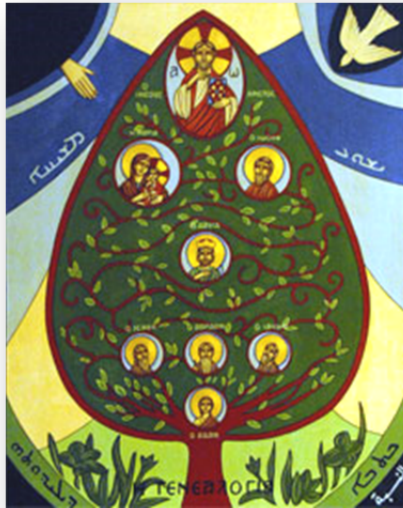
Tree of Jesse Icon