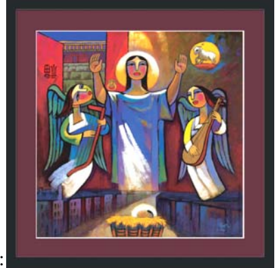
Messiah , He Qi, contemporary

Music: Ralph Vaughn Williams, "The Call," Five Mystical Songs (1911)